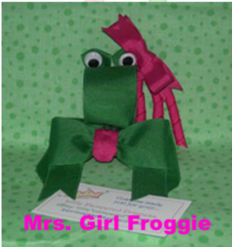
Mrs. Girl Froggie